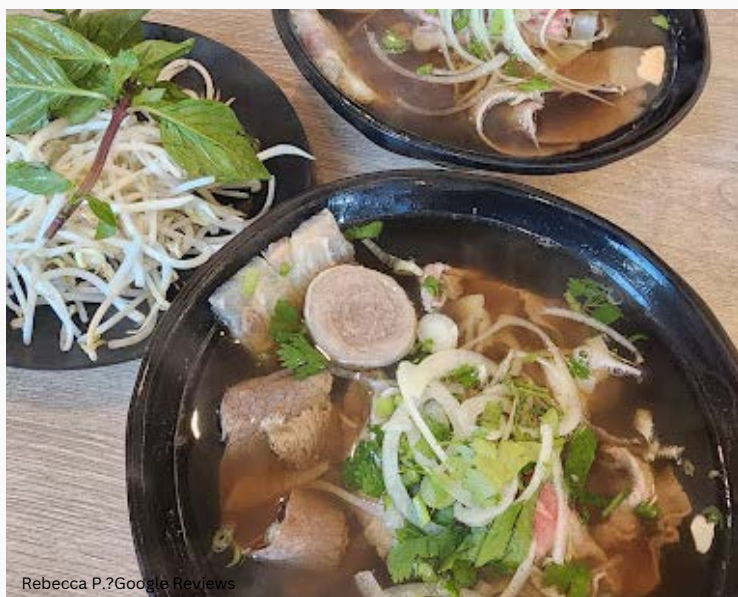
Rebecca P.?Google Reviews

Pho 68 is located at 13639 George Junction and is also available on UberEats!