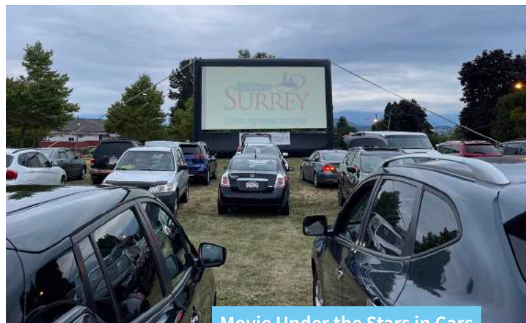
Movie Under the Stars in Cars