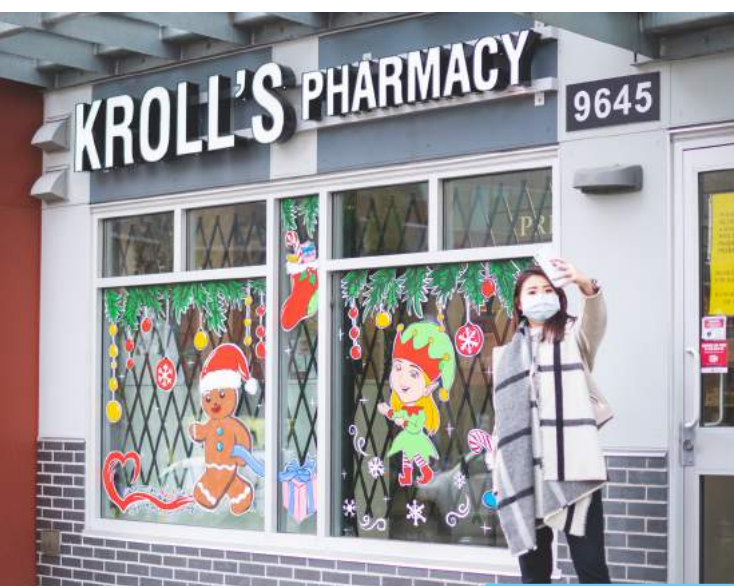
Santa Window Walk