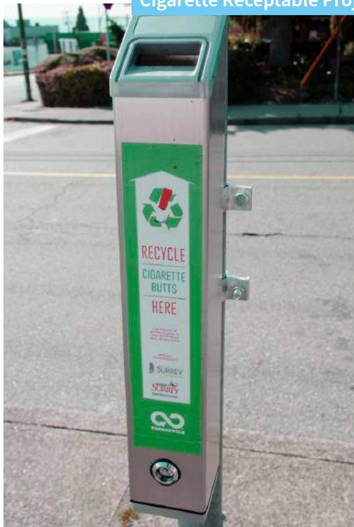
Cigarette Receptacle Project