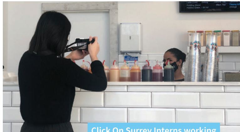
Click On Surrey Interns working with businesses