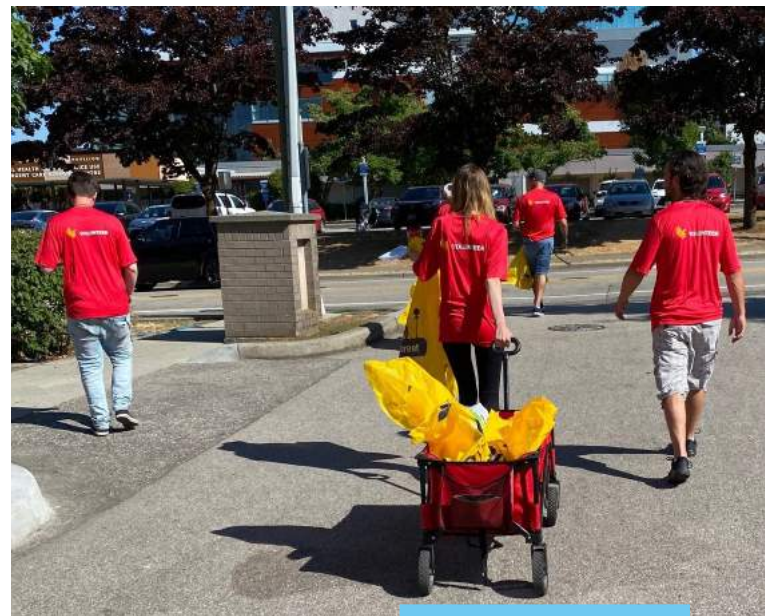
Community Clean Up