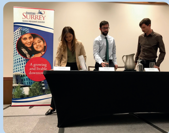
All Candidates forum at Civic Hotel in October