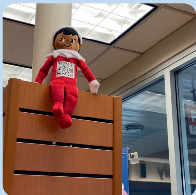
Elf on the Shelf

In late November, our Elf on the Shelf initiative returned to King George Hub and expanded to the Dell Shopping Centre, inviting participants to follow clues and discover hidden elves, offering a chance to win gift cards to local businesses. December brought our popular Gingerbread Contest outside Winners in Central City Shopping Centre.