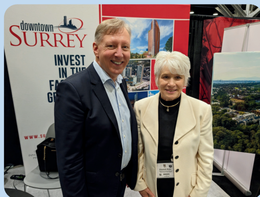
Buildex Trade Show

Downtown Surrey has emerged as a premier destination for businesses and residents alike, offering unparalleled opportunities for investment, development, and community growth. The Downtown Surrey Business Improvement Association (DSBIA) is dedicated to fostering economic prosperity by implementing strategic initiatives that align with our core mission and the objectives of our standing committees.