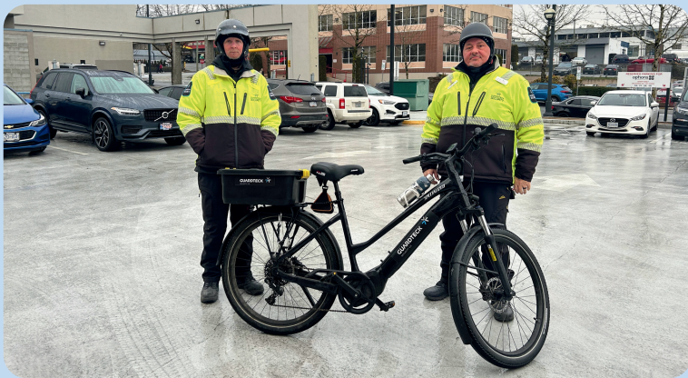
The Bike Patrol

Beyond responding to calls from local businesses, the Bike Patrol proactively reported issues such as broken windows, graffiti, and illegal dumping.