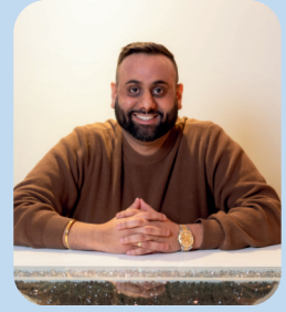
Harp Khela Allure Ventures