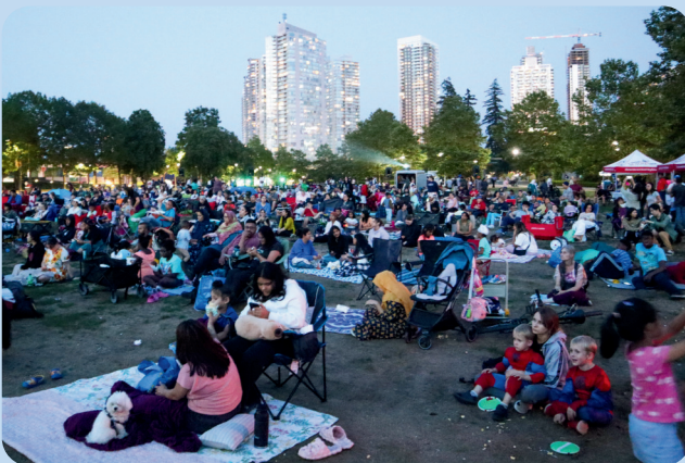
Movies Under the Stars