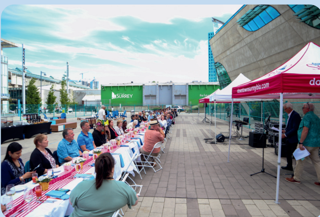
Long, Long Table