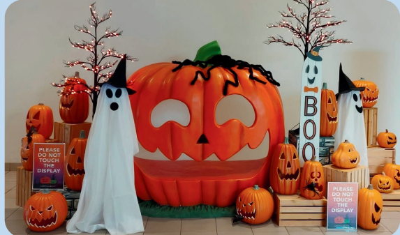
Halloween at Central City