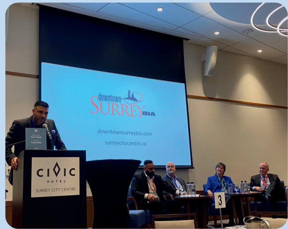
Panel on Economic Benefits of SFU Medical School

Media Engagement: In collaboration with the Laura Ballance Media Group (LBMG), we launched a comprehensive media campaign to highlight Downtown Surrey's developments. This included public relations efforts, advertising, and promotions throughout 2024, culminating in a seasonal Christmas campaign. Our media strategy encompassed interviews and features in prominent publications, emphasizing the Health & Technology District and developments south of the Fraser River.