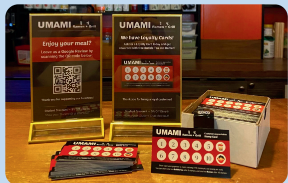
One of Click on Surrey's team projects