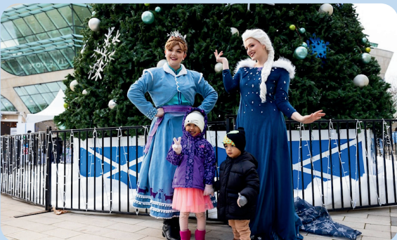
Tree Lighting Festival