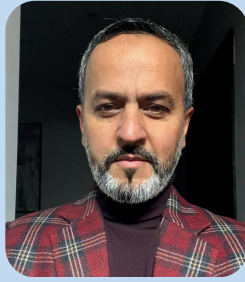
Kanwar Dhamraid Oviedo Properties