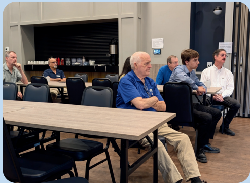
The Safety Meeting

In January 2024, the DSBIA hosted an informational meeting about a new supportive housing project to be built on Bentley Road, across from the greenspace previously home to Grosvenor Road Elementary School. Representatives from BC Housing and the City of Surrey attended to provide details and answer questions.