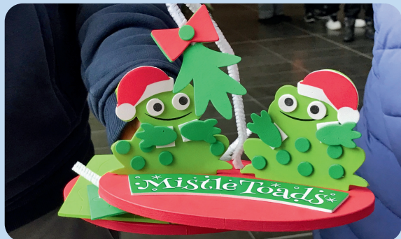
Tree Lighting Festival