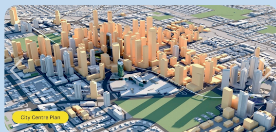
City Centre digital map