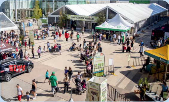
Party for the Planet