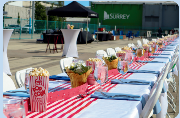
Long, Long Table