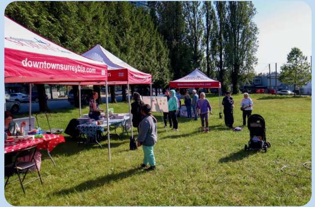
Greenspace at Grosvenor Road